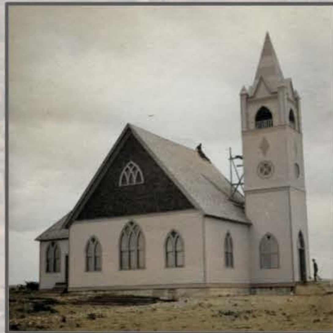
ORIGINAL METHODIST CHURCH KENNEWICK AVE AND DAYTON ST.