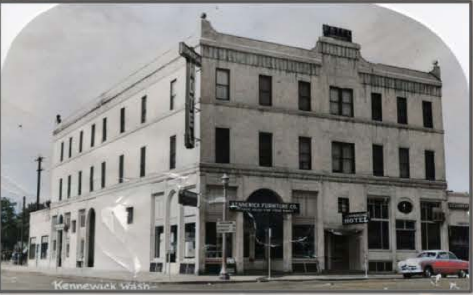
COMMERCIAL INN HOTEL Originally at KENNEWICK AVE & WASHINGTON ST.