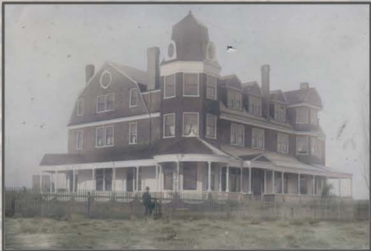
THE COLUMBIA HOTEL Originally near COLUMBIA DR. AND DAYTON ST.