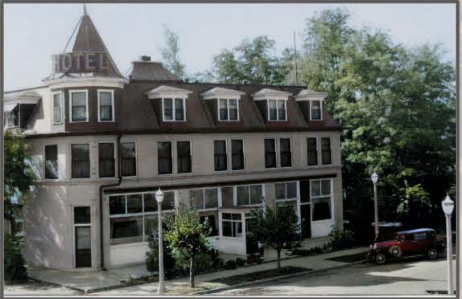
HOTEL KENNEWICK Originally at KENNEWICK AVE. AND CASCADE ST.

LEARN MORE ABOUT THESE LOST BUILDINGS AT BENTON COUNTY HISTORY MUSEUM & HISTORICAL SOCIETY