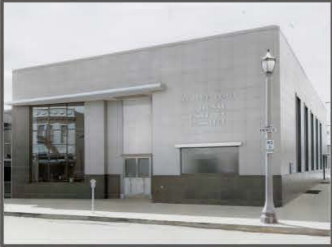
NATIONAL BANK OF COMMERCE Originally at KENNEWICK AVE AND AUBURN ST.