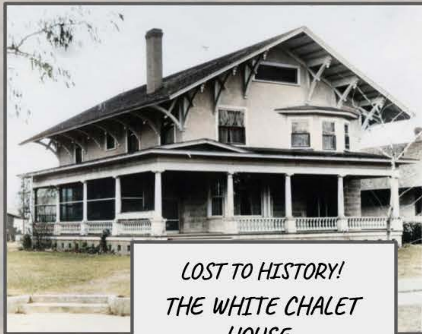
LOST TO HISTORY! THE WHITE CHALET HOUSE- Originally at KENNEWICK AVE & FRUITLAND ST.